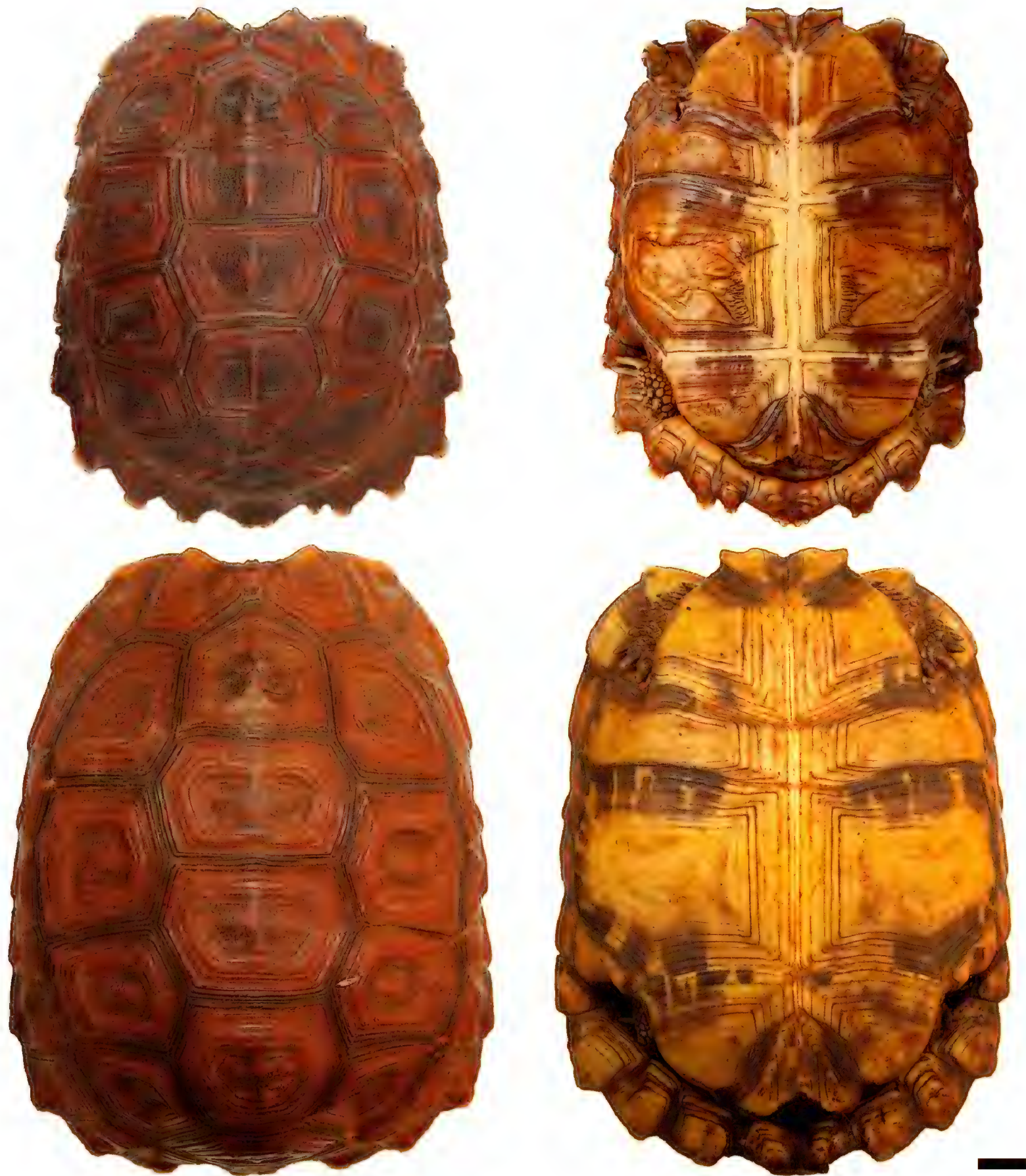
Fig. 4. Top: Juvenile Lobatse Hinge-back Tortoise ( Kinixys lobatsiana , SCL = 81 mm) from Sigurwana, western Soutpansberg, Limpopo. Bottom: Young Speke's Hinge-back Tortoise ( K. spekii , SCL = 106 mm) from Leshiba Wilderness, western Soutpansberg. Scale bar: 1 cm. Species identification of both tortoises was genetically confirmed.

(Ihlow et al. 2019). However, this character does not always suffice in juveniles (Fig. 4). To enable later re-examination, photographs should document the dorsal, ventral, and lateral aspects of each tortoise. In addition, molecular genetic confirmation is recommended.